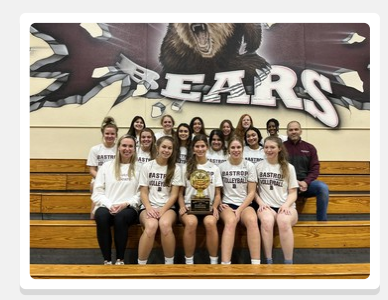
BHS Lady Bears

BHS v A&M Consolidated Saturday, November 6, 2021 2:00 pm @ Giddings